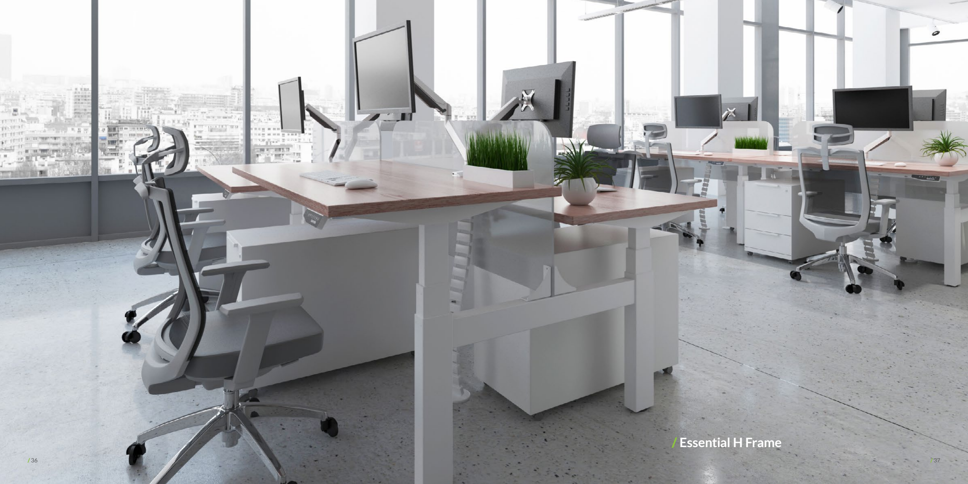
/ Essential H Frame