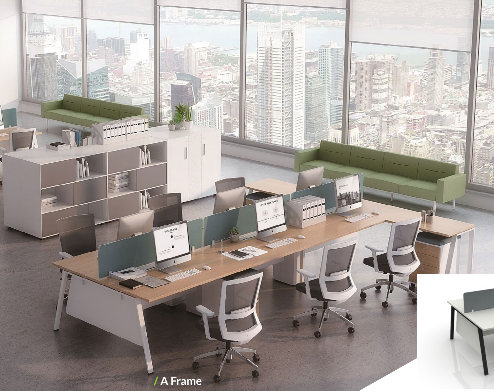
/ A Frame